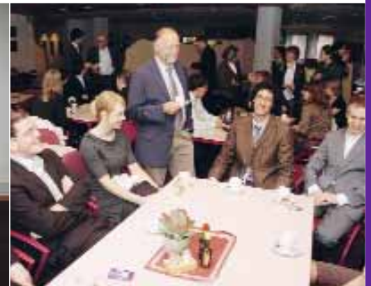
The final presentations of the students were hosted by ITC