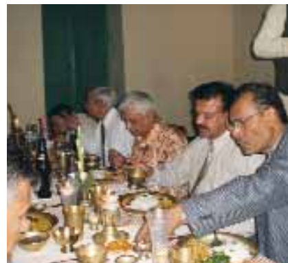
Traditional dinner hosted by the Nepal Survey Department

During the visit of ITC's director external affairs, the Survey Department hosted a traditional dinner attended by the Secretary of the Ministry of Land Reform and Management, the three joint secretaries of the ministry, and senior staff of the Survey