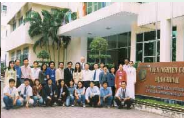
Each year ITC organises some ten refresher courses across the world