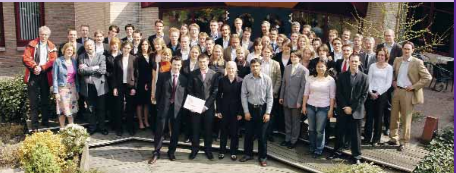
2nd year students from Utrecht University, together with supervisors from Utrecht and Enschede, and students and staff from ITC