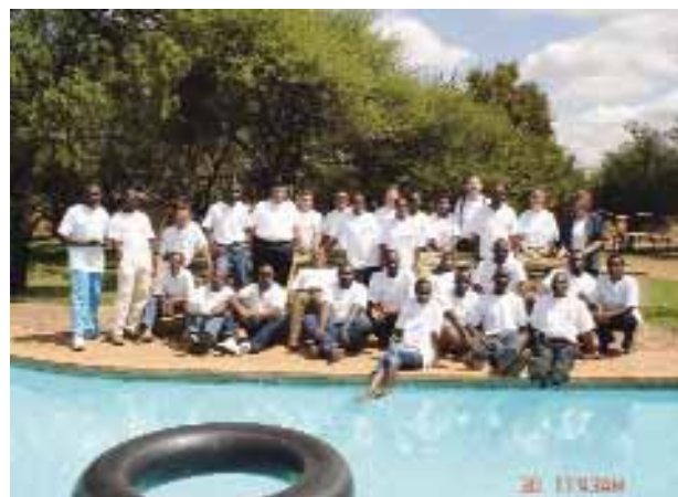
Some of the participants