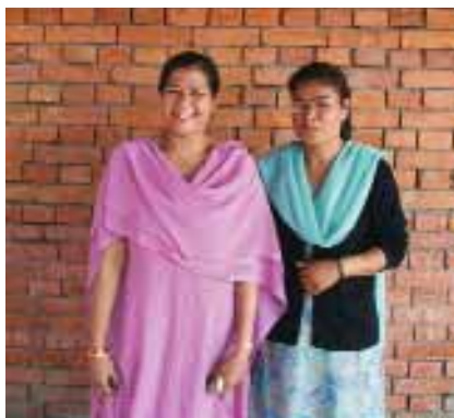
ITC alumni working at the NGII