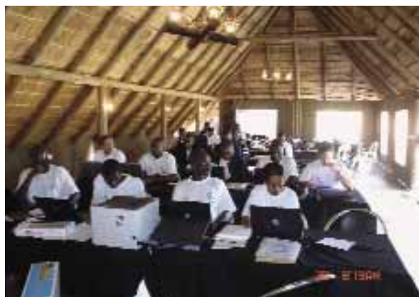
Workshop in session

Participants were given step-by-step guidance, based on best practice case studies, on how to formulate the introduction, methodology, results, discussion and abstract. In addition, they were taught how to develop an argument/structure (propositions, experiments, methods, data and deductions) within the context of geoinformatics and disaster assessment. A course on structural writing, using MS Word outlining tools, was also included to enhance writing skills. Furthermore, the use and abuse of the English language in scientific writing, the presentation of graphical evidence, and tips, tricks and no-no's in preparing graphs, images and tables for publication were reviewed. Lectures were always followed by practicals (ratio of one-third theory to two-thirds hands-on). The mini-conferences every