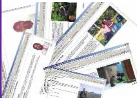
Figure 1: Student homepages improve contact between students and staff

Course participants received a CD Rom with all course materials, which they could access through Blackboard®.