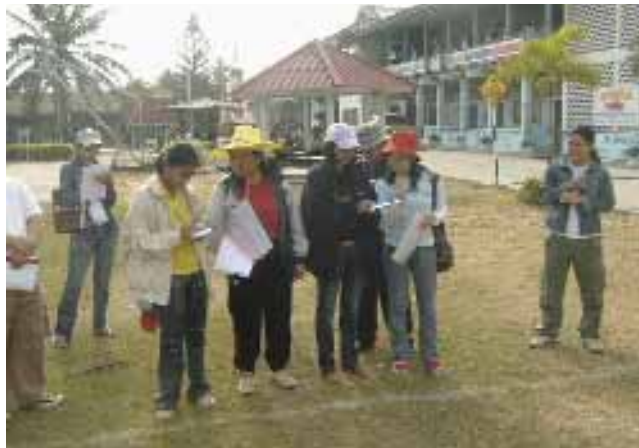
Orientation on orthophoto and Ikonos image at Huay Nam Pu School