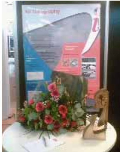
The elegant award representing the logo of Ruimte voor Geo-Informatie