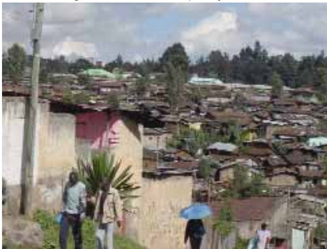
There is a strong link between land and poverty

Within the African context, as well as in many other developing regions, there is a vast demand for skills in the land administration area, including competencies to strengthen transparency. Developing tools in these areas without simultaneously building capacity to implement them is unlikely to create a sustainable impact.