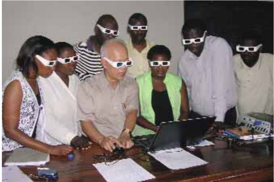
Anaglyph stereo for stereo digitising: for mapping purposes, the 3D anaglyph glasses can enable an operator to interpret and measure topographic features such as roads, buildings and rivers

cooperation with Digital Photogrammetry Enterprise (DPE), one of the biggest concerns of the Aerial Photogrammetry Company (APT). APT is a state-owned company that falls under the Ministry of Natural Resources and Environment.