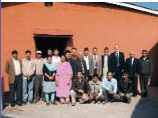
ITC alumni employed at the Nepal Survey Department