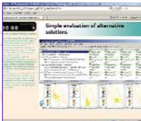
Figure 2: Structured slide presentations with voice-over facilitate the revisiting of lectures