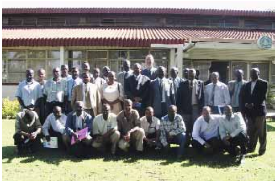
Course participants and guests present at the official opening at RCMRD, Nairobi, Kenya

The course has an interesting set-up. It is partly given at RCMRD in Nairobi and partly at the premises of Egerton University in Njoro, and the teaching staff come from RCMRD, Egerton University, Addis Ababa University and ITC. The course has an application-oriented focus. The use of earth observation and GIS techniques for various aspects of water resources