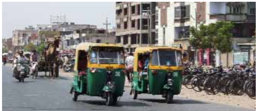
Transport plays an important role in urban development