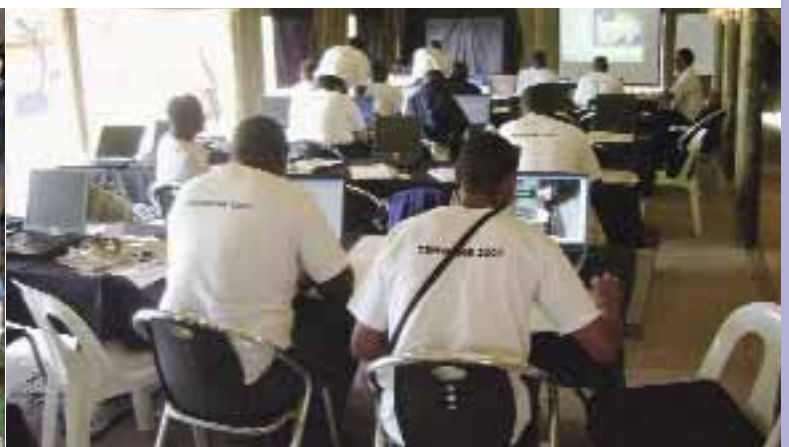
Classroom in session