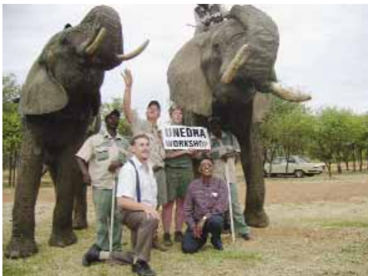
UNEDRA workshop: even the elephants want to join!

evening gave the participants the opportunity to read pieces of their work so that everyone could comment. The publication process, including group readings, checking and proof reading, was undertaken in pairs. Once completed, the work was submitted for review to the editors in place, and every detail (including English usage and spelling) was checked. At the end of the course, participants had a better understanding of the structure of scientific writing, had attained the state of the art in writing papers for peer-reviewed journals, and had a scientific manuscript ready for journal submission.