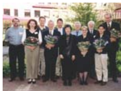
Members of the International and Local Organising Committees

quantity and quality of spatial information and enhancing analytical capabilities can alter power relationships in governance.