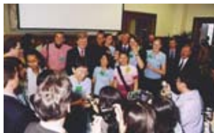
His Royal Highness, Crown Prince Willem-Alexander of the Netherlands with one of the prize winning teams

with a view to organising this event on a regular (for example) two-yearly basis. As such, the investment of the students in water partnership building across the world could form an integral part of their course curriculum in the faculties of the international education Institutes in the Netherlands (IHE, ITC, ISS) and collaborating universities.