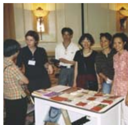
The ITC booth in Hanoi