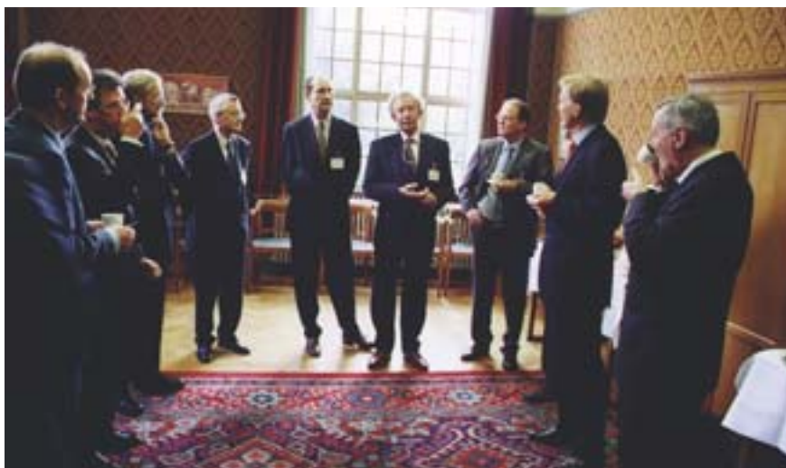
His Royal Highness, Crown Prince Willem-Alexander of the Netherlands talking international water management issues with organizing Committee members at the Peace Palace, The Hague

with a view to organising this event on a regular (for example) two-yearly basis. As such, the investment of the students in water partnership building across the world could form an integral part of their course curriculum in the faculties of the international education Institutes in the Netherlands (IHE, ITC, ISS) and collaborating universities.