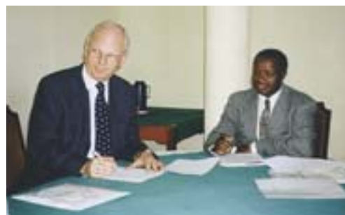
Signing the Memorandum of Understanding with Moi University, Eldoret, Kenya