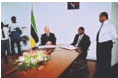
Rector of ITC and Deputy Minister for Coordination of Environmental Affairs (MICOA) sign five-year Memorandum of Understanding