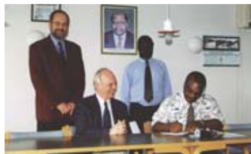
Signing the Memorandum of Understanding with the University College of Lands (UCLAS), Dar es Salaam, Tanzania