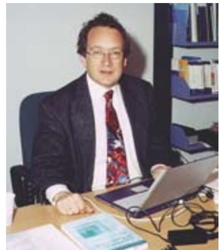
Alfred Stein, editor-in-chief of the International Journal of Applied Earth Observation and Geoinformation

Papers addressing such topics within the context of the social fabric and economic constraints of developing countries are particularly welcome.