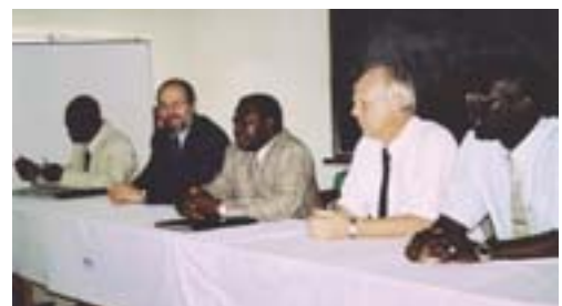
Meeting with RECTAS staff and PhD students (April 2002)

In Mozambique the main aim of the visit was to sign a five-year Memorandum of Understanding with the Ministry for Coordination of Environmental Affairs (MICOA). At the same time a contract to start collaborative activities was signed. The collaboration is estimated at US $ 3.7 million over the next five years. Representatives of the Dutch embassy were present at the signing ceremony. A visit was also made to the University Eduardo Mondlane, a partner in the collaboration with MICOA.