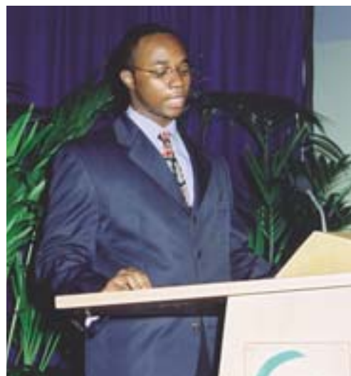
Words of welcome during the Opening of the Academic year by the SAB

Activities started with parties at the end of every module. In the former SIC room the joy and social interaction released the tension of exams and reports. Parties recharged our batteries for another three weeks of hard work. One of the best parties was the farewell party of the 1998-2000 MSc students. So many people came along that for a while they could hardly fit in the SIC room, and music from all regions of the world kept the spirit of celebration alive.