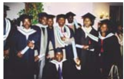
Land management graduates at the Polytechnic of Namibia (April 2002)