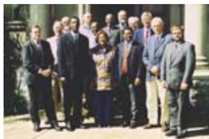
University of Natal INSHURD/TELMSA Phase 2 Steering Committee (April 2002)