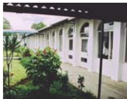
MICOA classroom facilities

The master's-level programme in environmental affairs will be hosted by, and developed with the assistance of the University Eduardo Mondlane (UEM). Cooperation with the Centre for Environment and Development (CEAD) of the University of Natal is planned, and it is anticipated that material developed under the TELMSA/IT-2 projects and under other CEAD programmes will be made available to UEM.