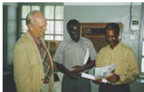
Ministry of Lands, Dept. of Surveying and Mapping

In one of its recommendations the workshop emphasised the great need to establish a network of educators and trainers in the field of GIS and remote sensing. The ITC initiative is aiming at just that - by building on national and regional capacity and linking educational institutes into a solid network of GIS and remote sensing training facilities.