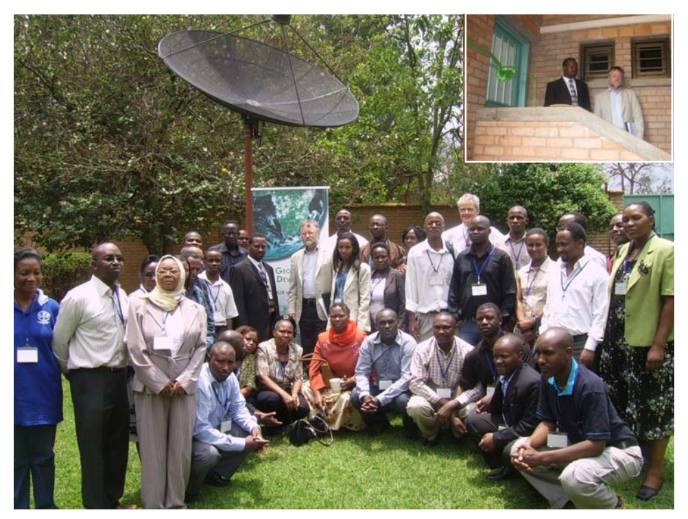
Figure 1: The participants after the opening session (under the GEONETCast receiving antenna), the inset shows the opening by the Director CGIS and the Vice Rector of NUR of the new lecture room, equipped with 30 computers and connected to the local area network, allowing access to the data and images disseminated by GEONETCast, used during the refresher course.

Despite a large number of applications for the refresher course (over 170), 28 participants were finally selected. Next to the NUFFIC sponsorship also funds could be utilized from the ITC Capacity Building fund. The origin of the selected African participants was: 1 from Chad, 5 from Ethiopia, 1 from Ghana, 4 from Kenya, 1 from Sudan, 1 from Tanzania, 3 from Uganda, 3 from Zambia, 1 from Zimbabwe and the other 8 participants were from Rwanda, mainly from CGIS and various NUR faculties.