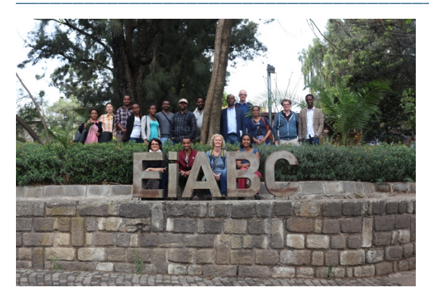
Project partners at EiABC

The tour commenced with a short visit to EiABC campus followed by a walk through the Informal kebele housing neighborhood at Coca Cola.