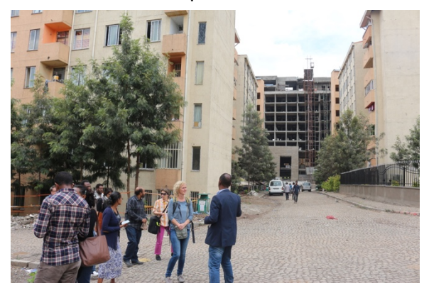
Project partners at Lideta Redevelopment Site

Participants had a chance to observe the overall neighborhood planning and the interior of different apartment typologies at the Lideta redevelopment site.