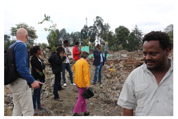
Project partners at Berbere Tera Site

Project partners later visited more inner city informal settlement sites slated for redevelopment at Berbere Tera, America Gibi, Arada, Dejach Wube.