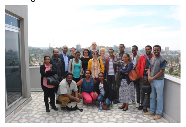
Commencement of thematic training at Tirar Hotel

Thematic Training and Site visit was conducted to SES project partners from DUK, Kassel, Twente (ITC), Mekele and Gondar Universities at Addis Ababa from 01-05 of May, 2017. Partners from Addis Ababa University, Ethiopian Institute of Architecture, Building Construction and City Development (EiABC) hosted the event. The five-day event comprised of site visits and training sessions.