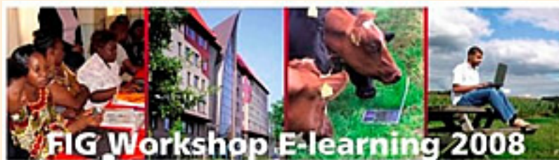
FIG Workshop at ITC

FIG International Workshop Sharing Good Practices